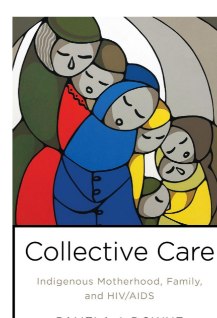
Collective care: Indigenous motherhood, family, and HIV/AIDS Call #: WD308 DOW 2021

We would love to hear your feedback on our latest newsletter!